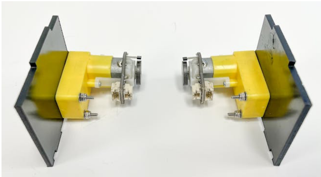
Left and right motor mounts with motors installed